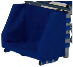
FootBox/ Huntingtons Package