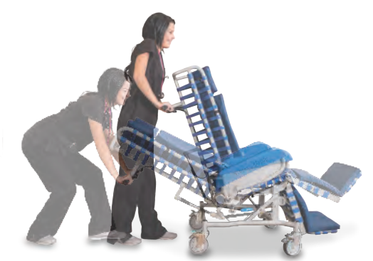
Ease of use/operation with unlimited positioning for enhanced comfort

NPUAP RECOMMENDS SHIFTING WEIGHT IN A CHAIR BOUND RESIDENT EVERY 15 MINUTES. 1