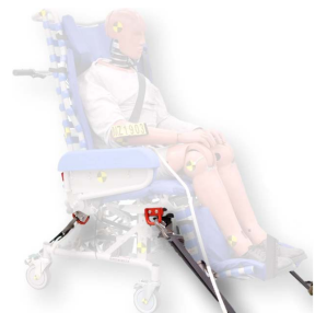
WC19 Transport Option