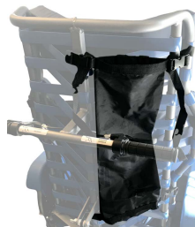
Oxygen Tank Holder